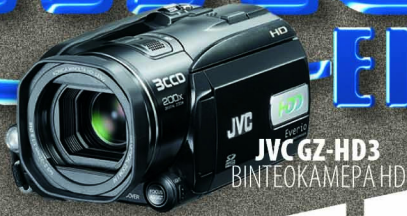
JVCGZ-HD3 BΙΝΤΕΟΚΑΜΕΡΑ HD

ΑΝΑΛΥΤΙΚΟΙ ΠΙΝΑΚΕΣ ΜΟΝΤΕΛΩΝ ΜΕ ΒΑΘΜΟΛΟΓΙΕΣ ΚΑΙ ΤΙΜΕΣ