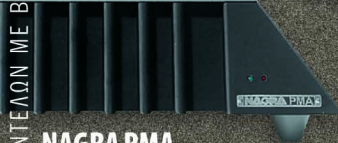
NAGRA PMA ΚΟΡΥΦΑΙΑ... ΊΣΧΥΣ

ΑΝΑΛΥΤΙΚΟΙ ΠΙΝΑΚΕΣ ΜΟΝΤΕΛΩΝ ΜΕ ΒΑΘΜΟΛΟΓΙΕΣ ΚΑΙ ΤΙΜΕΣ