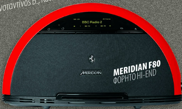
MERIDIAN F80 ΦΟΡΗΤΟ HI-END