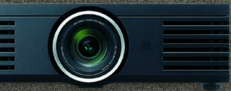
PANASONIC PT-AE2000 FULL BLACK