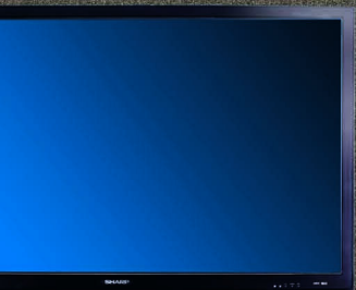
SHARP LC-46XL2E Η ΠΙΟ ΛΕΠΤΗ LCD TV