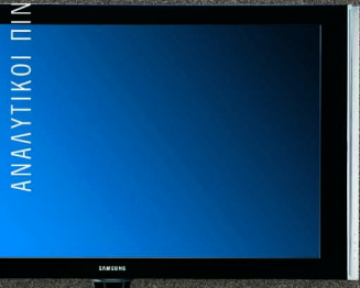
SAMSUNG LE-52F96BD LCD TV ME LED