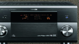
YAMAHA DSP-Z11 TOP HOME CINEMA